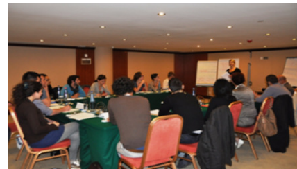
Photo: EASO training session

During 2012 and 2013, EASO will review and strengthen existing training resources and take an inclusive approach in the development of new tools and selection of new training methodologies. In doing so, EASO will work to ensure consistency and compliance of the training tools with the standards set in international and European law and jurisprudence.