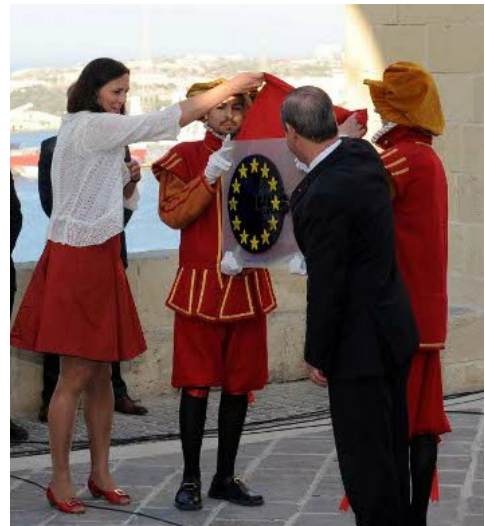
19 June 2011 - unveiling of the EASO official logo: Commissioner Malmström and Prime Minister Gonzi.