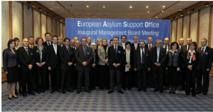
25/26 November 2010: First meeting of the EASO Management Board.