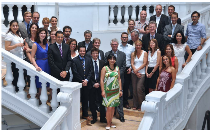
19 June 2012 - EASO staff in Malta. In a year EASO grew to more than 44 staff members.