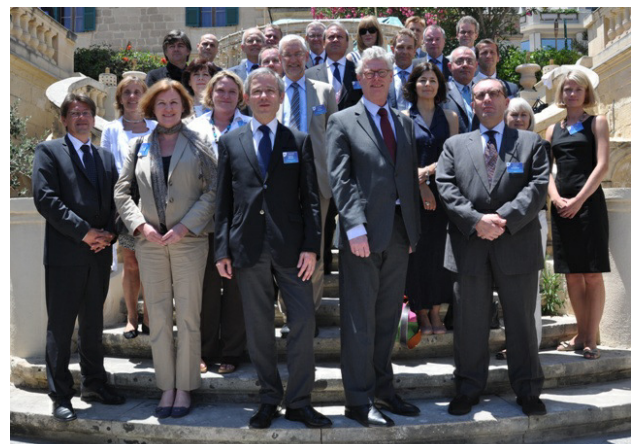
18/19 June 2012 - 7th Meeting of the EASO Management Board